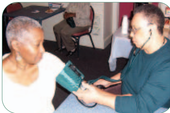
Checking your blood pressure frequently as you age is important.