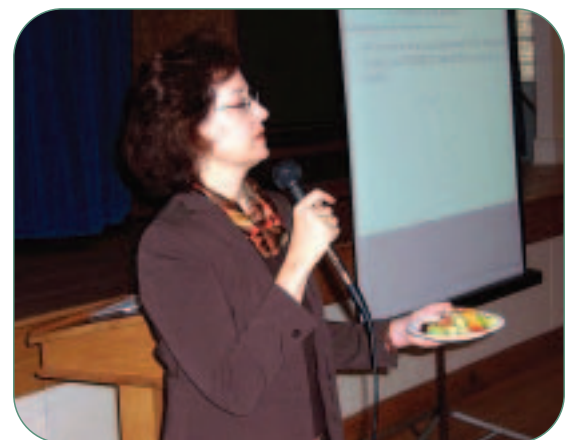
Portion control is very crucial to those with diabetes.

Diabetes is diagnosed by a simple blood test you can request from your doctor.